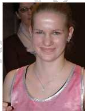
Photo: New WBF womens world bantamweight champion Renata Szebeledi from Hungary.

Hungarian title holder Renata Szebeledi rejoiced when finally she was crowned world champion in her third attempt last Saturday (July 2) in Lemgo, Germany after she upset local favorite Pia Mazelanik in an intense battle to win a unanimous 10-round verdict and with it the vacant WBF womens world bantamweight championship.